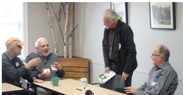
A meeting at the Mill of Kintail Gatehouse