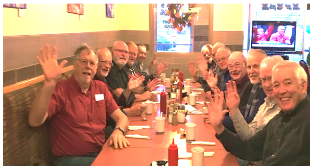
Breakfast at the Superior Restaurant