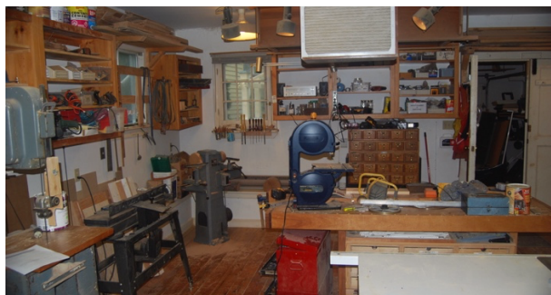
The workshop in Appleton