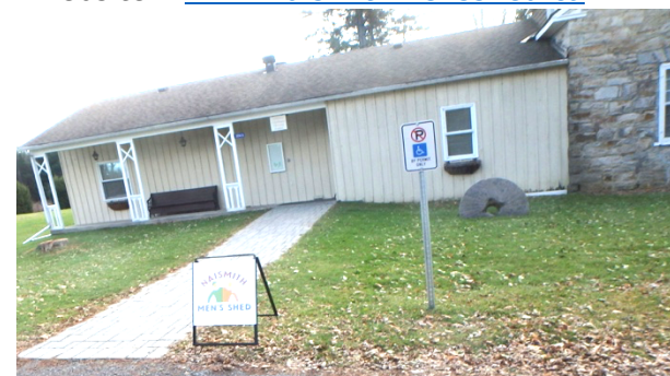
The Mill of Kintail Gatehouse meeting place