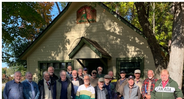
Our shed at the Mill of Kintail